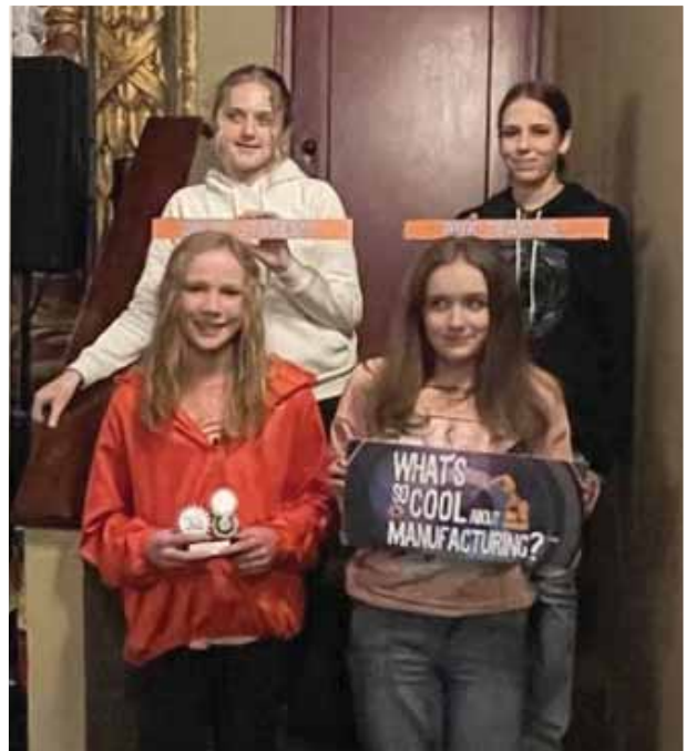
The student team from North-Penn Liberty won the "Northern Tier Influence" award and also moved on to the statewide competition in Harrisburg.