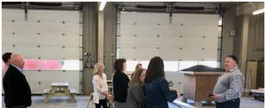
Building Construction Trades Tour