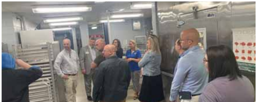
Food Service Production and Management Tour