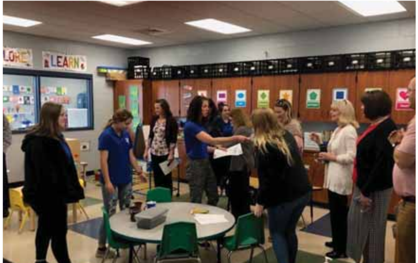
Early Childhood Education Tour

Participants were divided into two tour groups and were able to observe students in their chosen programs of study. Northern Tier Career Center has 12 robust programs of study. More information can be found at ntccschool.org . Meeting attendees were able to talk to students and instructors during the tour. Members stated that it was nice to make connections with students and instructors when the tour was completed. Students at the career center are sought after by local employers because their training prepares them for immediate employment when they complete their program of study.