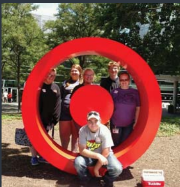
Tioga County youth enjoyed a hands-on field trip to the Corning Museum of Glass.

Following Academic Enrichment Week the students began employment at the YMCA, Mansfield Borough, and Cowanesque Valley High School.