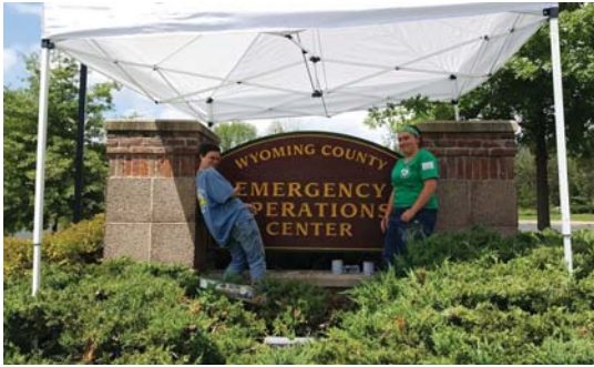
Youth completed painting, weeding, and other important maintenance tasks at various sites.

While working with career advisors, Trehab youth clients may be referred to workshops, career coaching, job referrals, employment preparation, and supportive services, which can sometimes include placement in paid work