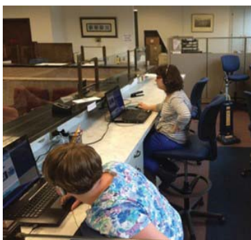
Students worked on resumes and learned job search skills.